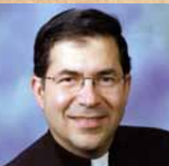
Fr. Frank Pavone